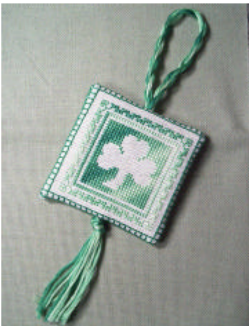
Model stitched by Abi L. on 28ct white Lugana with DMC 125.